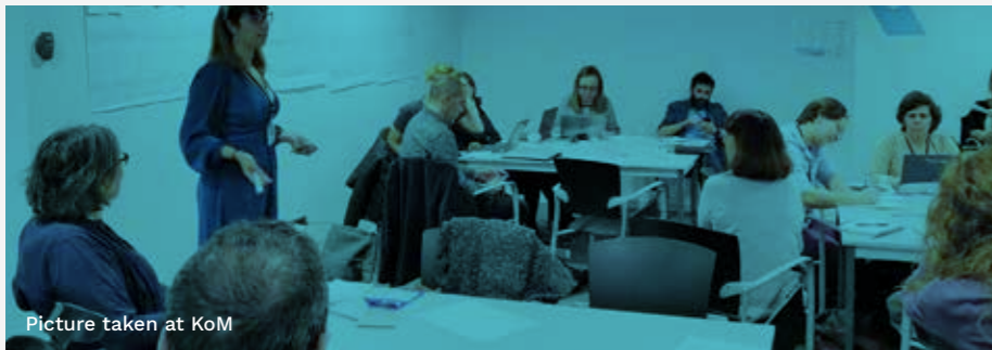
Picture taken at KoM

NEWSERA studies ways to improve the communication strategies of citizen science projects, in order to address more effectively different audiences: members of the general public, academic scientists, policy makers, entrepreneurs and industries (the major actors in the innovation system, according to the quadruple helix model), as well as data journalists and science communicators. The project brings together partners with different fields of experience: researchers with experience in sociology, citizen science practitioners and science communication experts.